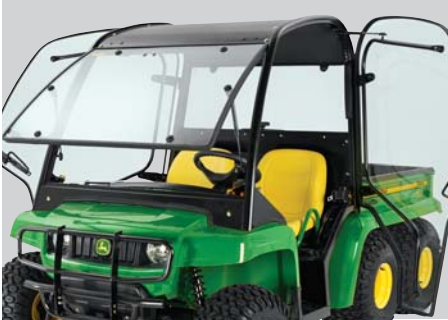
Let’s face it. Sometimes you need to be protected from the environment. Not the other way around. Choose from a variety of cab options.