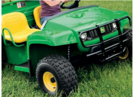
Standard traction assist/differential lock can kick in when the going gets tough. Cayman Turf tires can grip without damaging turf, and are made to last.