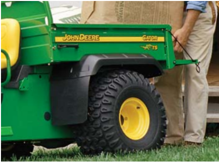
Conveniently lower to the ground, 16-gauge steel cargo box requires less effort to load and unload. Tilts for easier dumping.